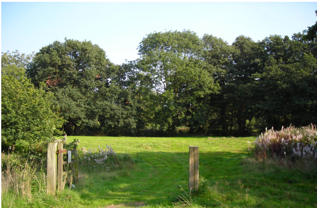
Moat central area (After)

After much hard work and repeated maintenance by the Group's volunteers, the scrub present in the central area of the Moat was reined back to such an extent that the area grassed up and could be regularly maintained (see below).