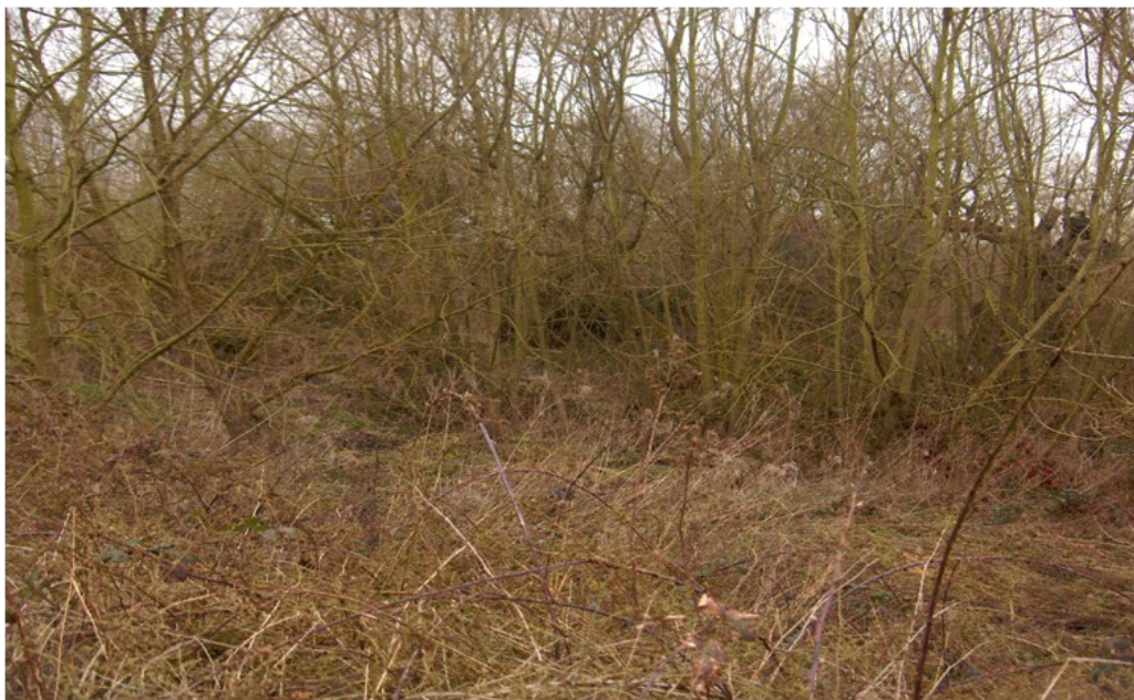
Moat central area (Before)

The Moat and the surrounding field is owned by the Diocese of Lichfield and leased to Shawbury Parish Council. Prior to 2006 the site had become neglected and was barely accessible; it was also unsightly due to overgrown vegetation, brush and scrub (see photo below). The Parish Council set up a small Working Group to try and tackle the problem of restoring order to the site.