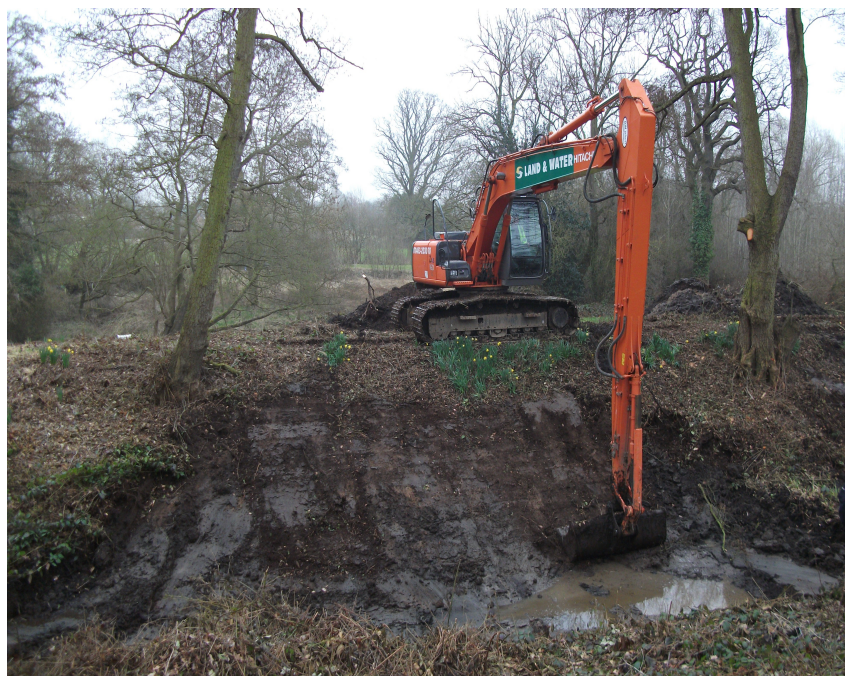
Restoring the Moat ditch/creating ponds

provide a haven for wildlife and further enhance the ecology of the site. An Archaeologist was present to oversee this work and safeguard the archaeology and ecology present, as well as undertaking palaeo-environmental sampling. The results of these investigations are in a report that is available to view at Shawbury Library.